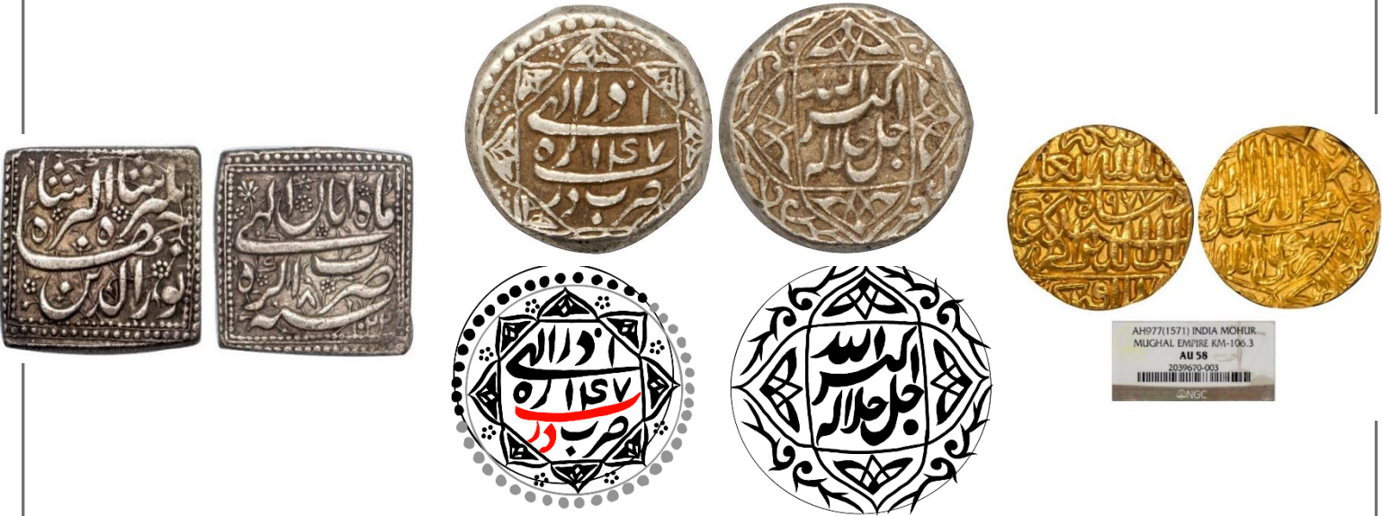
AH977/1571 INDIA MOHUR MUGHAL EMPIRE KM-106.3 AU 58 2039670-003 NGC