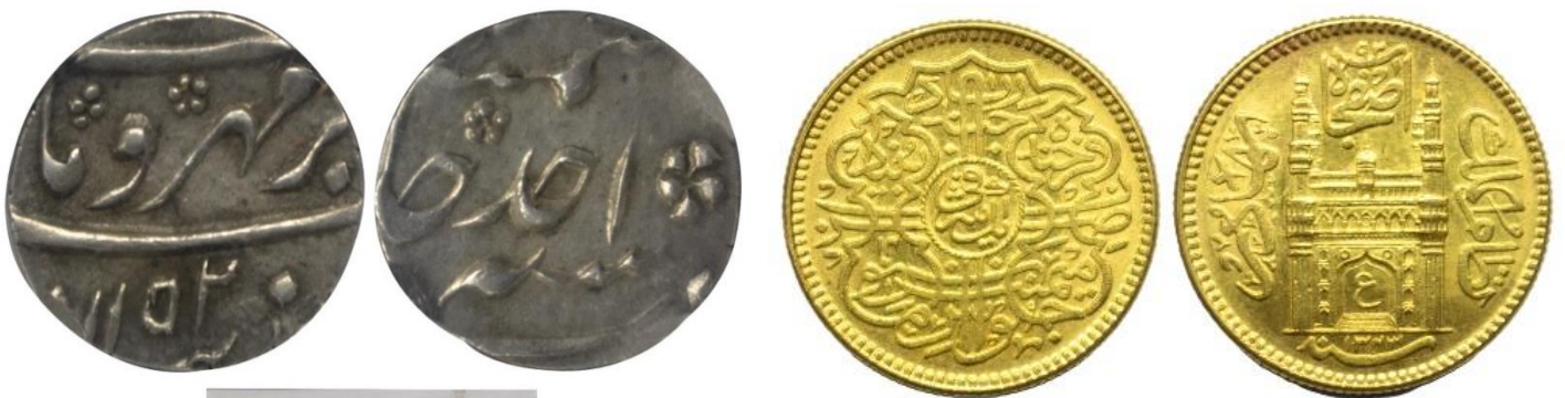
AH1152//1 AFSHARID 1/4R NADIR SHAH MURSHIDABAD (TYPE F) MS 62 (2.90g) 6617037-003 NUMISMATIC GUARANTY COMPANY NGC