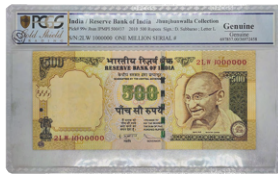
Lot: 601 Paper Money, Republic India, 500 Rupees, Fancy Number '1000000', Signed by D Subbarao, Graded by PCGS as Genuine. Estimate: ₹4000 - ₹5000