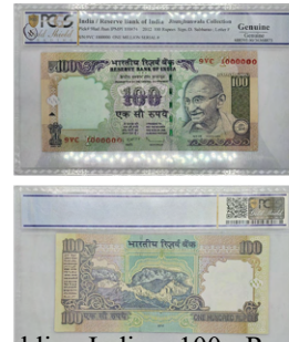
Lot: 600 Paper Money, Republic India, 100 Rupees, Fancy Number "1000000", Signed by D Subbarao, Graded by PCGS as Genuine. Estimate: ₹4000 - ₹5000