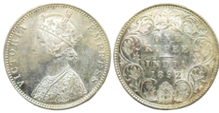
Lot: 561 British India , Victoria Empress, One Rupee, 1892,C21,B incuse, Bombay Mint. Estimate: ₹10000 - ₹12000