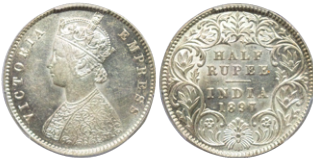
Lot: 563 British India, Victoria Empress, 1897, Half Rupee, Calcutta Mint, Graded as AU55 by PCGS. Estimate: ₹30000 - ₹35000