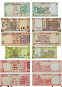
Lot: 603 Paper Money, Republic India, Set of 11 notes, with Number "260150" marking the day our Constitution was formed 26th January 1950, Denominations- 5,10(2),20(3),50,100,500(2),2000, AU TO UNC, Extremely Rare as a set. Estimate: ₹60000 - ₹65000