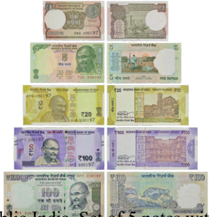
Lot: 606 Paper Money, Republic India, Set of 5 notes with Number "230197" marking Netaji Subhash Chandra Bose Birth Date 23rd January 1897. Denominations- 1,5,20,100(2). AU to UNC Estimate: ₹8000 - ₹10000