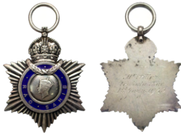
Lot: 597 Medals, Indian Title Badge, George VI, Silver, Rai Bahadur, awarded Estimate: ₹24000 - ₹25000