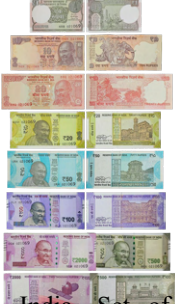
Lot: 605 Paper Money, Republic India, Set of 8 notes, with Number "021069" marking Gandhi Ji Birthday, 2nd October 1869, Denominations- 1,10,20(2),50,100,500,2000. AU to UNC. Estimate: ₹50000 - ₹55000