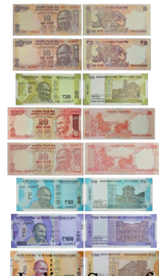
Lot: 604 Paper Money, Republic India, Set of 11 notes, with Number "150847" marking the day of our Independence 15th August 1947, Denominations- 10(2),20(3),50,100,200,500(2),2000. AU to UNC. Estimate: ₹65000 - ₹70000