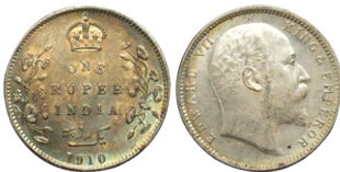
Lot: 567 British India, Edward VII, One Rupee ,1910, Calcutta Mint, Uncirculated, Naturally Toned. Estimate: ₹15000 - ₹20000