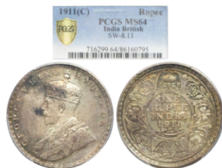
Lot: 570 British India, George V, 1911, One Rupee, Calcutta Mint, Graded as MS64 by PCGS, Extremely Rare. Estimate: ₹35000 - ₹40000