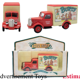
Lot: 611 Tin and Bacalite Advertisement Toys Estimate: ₹1200 - ₹1500