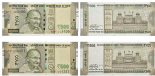
Lot: 599 Paper Money, Republic India, 500 Rupees, set of 2 notes, Fancy Number, "123456" and reverse "654321", Signed by Shaktikanth Das. Both Notes of Same Prefix. Uncirculated. Estimate: ₹2000 - ₹2500