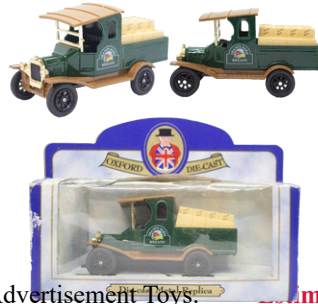
Lot: 608 Tin and Bacalite Advertisement Toys. Estimate: ₹1200 - ₹1500