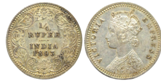
Lot: 562 British India, Victoria Empress, 1893, Calcutta Mint, Silver 1/4 Rupee, Obv. Crude Legends, Uncirculated Estimate: ₹10000 - ₹12000