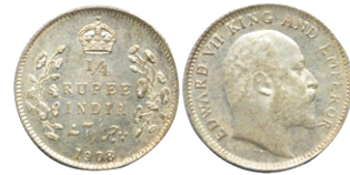
Lot: 566 British India,Edward VII King, Quarter Rupee ,1908, UNC, Calcutta Mint Estimate: ₹3500 - ₹4000