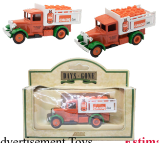
Lot: 609 Tin and Bacalite Advertisement Toys Estimate: ₹1200 - ₹1500