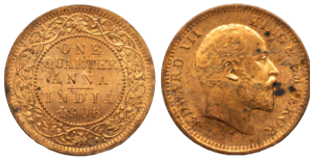
Lot: 565 British India, Edward VII King, Quarter Anna ,1906,Copper Red UNC Estimate: ₹2000 - ₹2500