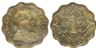
Lot: 569 British India 1910 edward VII, one Anna, Extremely Fine. Estimate: ₹5000 - ₹6000