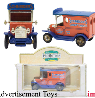
Lot: 610 Tin and Bacalite Advertisement Toys Estimate: ₹1200 - ₹1500