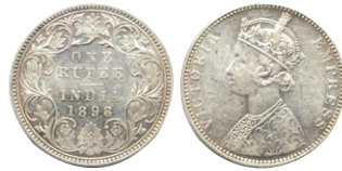
Lot: 564 British India, Victoria Empress, 1898, One Rupee, 8 over 4, About Uncirculated. Estimate: ₹15000 - ₹20000