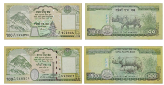
Lot: 607 Paper Money, Nepal, 100 Nepali Rupees, Set of 2 Notes, Fancy Number "123456" and reverse "654321", Uncirculated. Estimate: ₹2000 - ₹2500