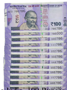
Lot: 602 Paper Money, Republic India, 100 Rupees, Set of 40 Notes, Fancy Number, 100000 to 1000000, 00001 to 000010, 111111 to 999999, 786786, 786000, 000786, 111786, 222786, 333786, 444786, 555786, 666786, 777786, 888786, 999786, 000687, 123456, 654321, 000108, 000143, 000541, 000420, 000214, 000916, All Notes Same Prefix, Signed By Shaktinath Das.