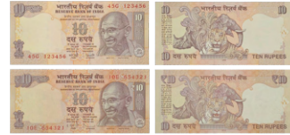
Lot: 598 Paper Money, Republic India, 10 Rupees, set of 2 notes, Fancy Number "123456" and reverse "654321", Signed by Y V Reddy and D Subbarao. Uncirculated. Estimate: ₹2000 - ₹2500