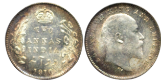
Lot: 568 British India , Edward VII King ,Two Anna , 1910,UNC, Calcutta mint Estimate: ₹2500 - ₹3000