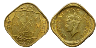
Lot: 832 George VI, Nickel-Brass, 1/2 Anna, 1943, Calcutta Mint, Dots by India, Dashes by year, F. Prid 984. GK 1407. Uncirculated Rare. Estimate: ₹500 - ₹600