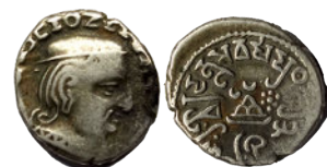
Lot: 106 Ancient, Western Kshatrapas, Abhiras, Ishvardatta (242 AD), Silver Drachm, 2.19 g very fine, scarce. Estimate: ₹2200 - ₹2500