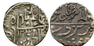
Lot: 594 Narwar State, Mahadji Rao, Silver Rupee, Narwar Mint, AH 1230, 10.88g, very fine.