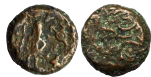
Lot: 40 Ancient, Ujjaini (c. 2nd century BC), Copper Unit, Mahakal Type, 7.54g, very fine, scarce. Estimate: ₹1500 - ₹2000