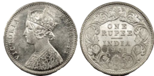
Lot: 720 Victoria Empress, Silver Rupee, 1901, Calcutta Mint, Uncirculated, Scarce. Estimate: ₹1200 - ₹1500