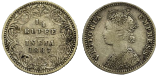
Lot: 727 Victoria Empress, Silver 1/4 Rupee, 1887, Calcutta Mint, Very Fine+, Scarce. Estimate: ₹1200 - ₹1500