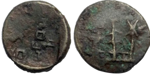
Lot: 79 Ancient, Panchala, Yajñabala (1st Century BC), Copper Unit, Pieper # 1369, pg. 210, 2.49g, very fine, scarce.