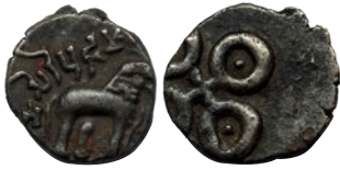
Lot: 97 Ancient, Satavahanas, Siri Pulumavi (c. 100 BC), 'Tarhala Hoard' Type, Copper Karshapana, 2.73g very fine. Estimate: ₹800 - ₹1000