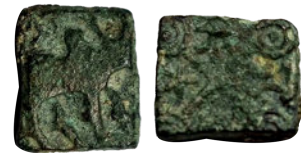
Lot: 44 Ancient, Ujjain region, Copper unit, 3.32g, fine. Estimate: ₹800 - ₹1000