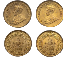
Lot: 806 George V King, Bronze 1/12 Anna, (2 Pcs) 1920, Calcutta Mint, Uncirculated. Estimate: ₹1200 - ₹1500