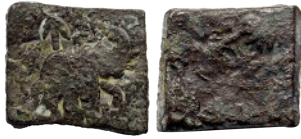
Lot: 61 Ancient, Pre Satavahana, Bhadra & Mitra Series (2nd Century BC), Vidarbha, Copper Unit, 10.31g fine, rare. Estimate: ₹2200 - ₹2500