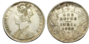
Lot: 716 Victoria Empress, Silver Rupee, 1892, Obv. A/ Rev. I, Calcutta Mint "C" Incuse, About Extremely Fine. Estimate: ₹1000 - ₹1200