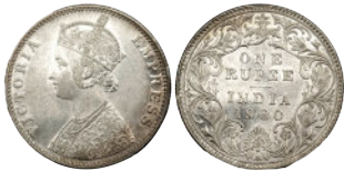
Lot: 719 Victoria Empress, Silver Rupee, 1900, Bombay Mint, Uncirculated, Scarce. Estimate: ₹1200 - ₹1500