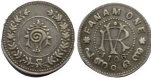
Lot: 609 Travancore State, Bala Rama Varma II (ME 1101-1126, 1924-1949 AD), Silver Fanam, ME 1106, KM # 65, 1.53g very fine, scarce. Estimate: ₹1500 - ₹1800