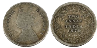
Lot: 730 Victoria Empress, silver 2 annas, 1879, Calcutta mint, 1.36g, 'C' incused. PR 494. fine, Rare. Estimate: ₹2500 - ₹3000