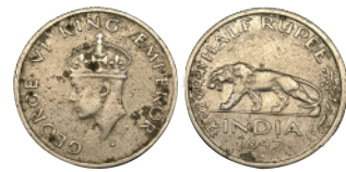
Lot: 824 George VI, Copper Nickel Rupee, 2 'o' Clock, 1947, Very Fine, Very Rare. Estimate: ₹1200 - ₹1500