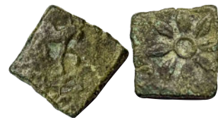
Lot: 30 Ancient, Post-Mauryan, Eran-Vidisha Region, Uninscribed type, Copper Unit, 1.33g very fine, scarce. Estimate: ₹1000 - ₹1200