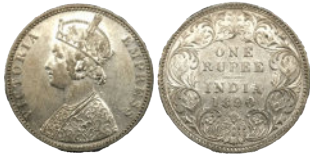
Lot: 713 Victoria Empress, Silver Rupee, 1890, Bombay Mint, Uncirculated, Scarce. Estimate: ₹1200 - ₹1500