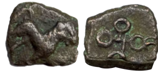
Lot: 82 Ancient, Satavahana, Vidarbha Region (1st Century BC), Copper Unit, 0.91g, fine to very fine, scarce.