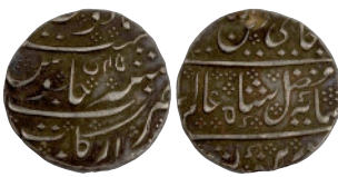
Lot: 613 Indo-French, Arkat mint, silver rupee, in the name of Shah Alam II, AH (12)20/RY 45, crescent mintmark on reverse, KM 15, 11.42g. Good very fine, Very scarce. Estimate: ₹1000 - ₹1200