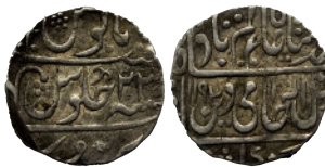
Lot: 593 Narwar State, Mahadji Rao (AH 1175-1209, 1761-1794 AD), Silver Rupee, Narwar Mint, AH 1196, RY 22, KM # 18, 11.18g, very fine, scarce.