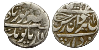
Lot: 608 Tonk State, Muhammad Ibrahim Ali Khan (AH 1284-1349, 1868-1930 AD), Silver Rupee, 11.11g very fine, scarce. Estimate: ₹1500 - ₹1800