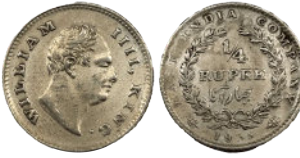
Lot: 675 William IV, Silver 1/4 Rupee, F Raised, About Extremely Fine, Very Rare. Estimate: ₹1500 - ₹2000