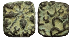
Lot: 100 Ancient, Maharathis from Vidarbha, Maharathi Talathata (c. 150-200 AD), Alloyed Copper Unit, 1.5g, very fine, rare. Estimate: ₹800 - ₹1000