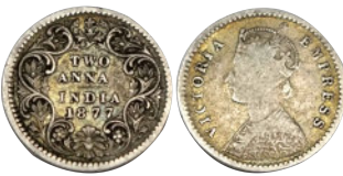
Lot: 729 Victoria Empress, Silver Two Annas, 1877, 1.44g, Calcutta Mint, Very Fine. Estimate: ₹2500 - ₹3000