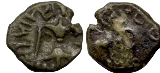
Lot: 104 Ancient, Western Kshatrapas (Kshaharatas), Bhumaka (1st Century BC/AD), Copper Unit, Pieper # 3333, 3.42g fine to very fine, very scarce. Estimate: ₹2000 - ₹2500