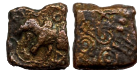
Lot: 68 Ancient, Pre-Satavahana, Sebakas of Vidarbha, (c. 2nd-1st Century BC), Copper Unit, 8.55g fine. Estimate: ₹2500 - ₹3000