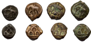
Lot: 21 Ancient, Sunga Period, Central India, Cast Copper, Set of 4 coins, Pieper # 323, very fine, scarce. Estimate: ₹800 - ₹1000