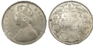
Lot: 723 Victoria Empress, Silver 1/2 Rupee, 1899, Bombay Mint, Uncirculated, Scarce. Estimate: ₹1200 - ₹1500