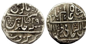
Lot: 595 Narwar State, Mahadji Rao (AH 1175-1209, 1761-1794 AD), INO Shah Alam II (AH 1174-1221, 1759-1806 AD), Silver Rupee, Narwar Mint, AH 1201, RY 29, KM #20, 10.70g, very fine, scarce.