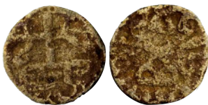
Lot: 29 Ancient, Central India, Lead Unit, Obv. Tree in railing, Rev. Three arched hill, 4.66g, very fine, very scarce. Estimate: ₹800 - ₹1000