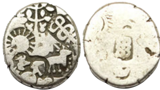
Lot: 15 Ancient, Mauryan, Magadha Imperial (C. 321-150 BC), Silver Karshapana, 3.36g very fine, scarce. Estimate: ₹1500 - ₹1700