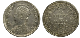
Lot: 728 Victoria Empress, Silver 1/4 Rupee, 1889, Calcutta Mint, 'C' Incuse in lower Flower, About Extremely Fine, Scarce. Estimate: ₹1200 - ₹1500