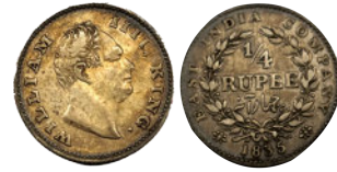
Lot: 674 William IV, Silver 1/4 Rupee, F incuse, Very Fine+, Very Rare. Estimate: ₹1500 - ₹2000