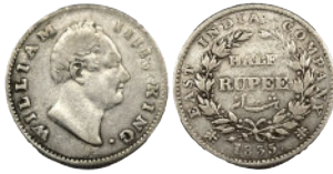
Lot: 673 William IV, Silver 1/2 Rupee, F incuse, Very Fine+, Very Rare. Estimate: ₹2000 - ₹3000