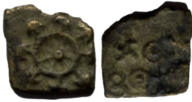
Lot: 63 Ancient, Pre-Satavahana, Vidarbha Region (1st Century BC), Copper Unit, 2.30 g fine to very fine, scarce. Estimate: ₹800 - ₹1000