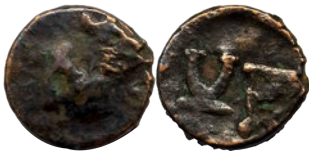
Lot: 27 Ancient, Taxila, (2nd-1st Century BC), Copper Unit, 2.27g very fine, scarce. Estimate: ₹1200 - ₹1500