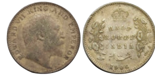
Lot: 756 Edward VII, Silver 1/2, 1906, Very Fine. Estimate: ₹1200 - ₹1500