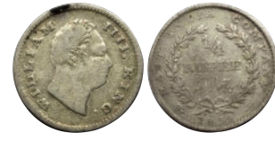
Lot: 676 William IV, silver 1/4 rupee, 1835, Bombay mint, No Initial, wreath with 19 berries (10L+9R), no dot after date. Fine, Very scarce. Estimate: ₹1200 - ₹1500