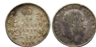
Lot: 762 Edward VII, Silver Two Annas, 1910, Bombay Mint, Dot on Stem, About Fine. Estimate: ₹1200 - ₹1500