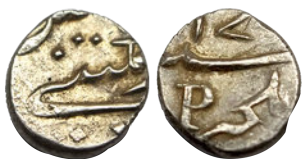
Lot: 615 Indo-French, Phulcheree Mint (Pondicherry), Silver 1/5 Rupee (Fanon), 2.32g, struck for Mahe, English letter 'P' for Pondicherry. (KM # 67). Estimate: ₹1500 - ₹1800