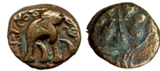
Lot: 86 Ancient, Satavahana, Chimuka, Paithan Nevasa Area, Potin Unit, 3.93g, About Extremely Fine, Rare