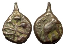
Lot: 85 Ancient, Satavahanas, Chhimuka (2nd-1st Century BC), Copper Alloy Unit, 2.69g very fine, rare.