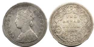
Lot: 731 Victoria Empress, Silver Two Annas, 1882, Bombay Mint, B/1 dot, Very Fine+, Very Rare. Estimate: ₹1000 - ₹1200