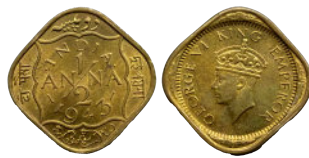
Lot: 831 George VI, Nickel-Brass, 1/2 Anna, 1943, Calcutta Mint, Dots by India, Dashes by year, F. Prid 984. GK 1407. Uncirculated Rare. Estimate: ₹500 - ₹600