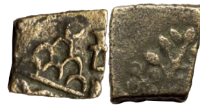
Lot: 102 Ancient, Maharathis from Vidarbha, Maharathi Talathata (c. 150-200 AD), Copper Unit, Uninscribed type, 2.77g very fine, rare. Estimate: ₹1500 - ₹2000