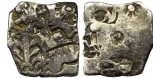
Lot: 14 Ancient, Mauryan, Magadha Imperial (C. 321-150 BC), Silver Karshapana, 3.07g very fine, scarce. Estimate: ₹1500 - ₹1700