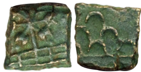
Lot: 103 Ancient, Maharathis from Vidarbha, Maharathi Talathata (c. 150-200 AD), Copper Unit, Uninscribed type, 1.86g very fine, rare. Estimate: ₹1000 - ₹1200