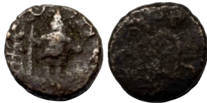
Lot: 37 Ancient, Ujjain (2nd-1st Century BC), Copper Unit, Mahakal Type, 3.54g very fine, very scarce. Estimate: ₹1000 - ₹1200