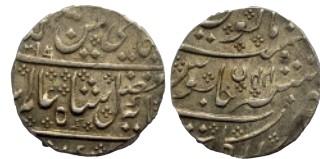
Lot: 612 Indo French, INO Shah Alam II (AH 1174-1221, 1759-1806 AD), Silver Rupee, Arkat Mint, AH 1219, RY 44, KM # 15, 11.42g very fine+, very scarce. Estimate: ₹2000 - ₹2500