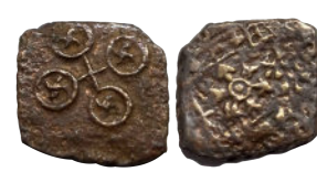
Lot: 50 Ancient, Ujjain, (2nd-1st Century BC), Copper Unit, Obv: Tree in railing, Ujjain symbol, Triangle standard (Indradhwaja), River below, Symbols on top are Fish tank and Chakra, Rev: Ujjain symbol with concentric orbs, similar Pieper # 763, pg. 111, 3.84g very fine, very scarce. Estimate: ₹2000 - ₹2500