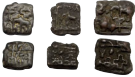
Lot: 23 Ancient, Sunga Period, Central India, Cast Copper, Set of 3 coins, Bop & Pieper # 9, very fine, scarce. Estimate: ₹800 - ₹1000