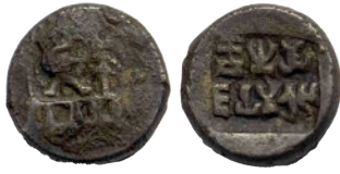
Lot: 77 Ancient, Panchala, Jayamitra (1st Century BC), Copper Unit, Pieper # 1337, pg. 206, 3.85g, very fine, very scarce.