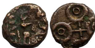
Lot: 49 Ancient, Ujjain (2nd-1st Century BC), Copper Unit, 2.16g about very fine, very scarce. Estimate: ₹1000 - ₹1200