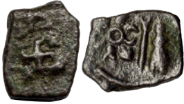
Lot: 33 Ancient, Saurashtra Janapada, (75-50 BC), Uninscribed die-struck, Copper Unit, W. Piper # 510, 4.35g very fine+, rare. Estimate: ₹800 - ₹1000