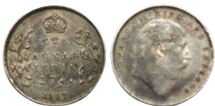
Lot: 761 Edward VII, Silver Two Annas, 1907, About Extremely Fine. Estimate: ₹1200 - ₹1500