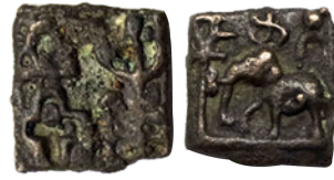
Lot: 22 Ancient, Sunga Period, Central India, Cast Copper Unit, Obv: Elephant to left front of taurine, below indradhvja and swastika, Rev: Tree-in-railing on right side, hollow cross, three arched hill above crescent and taurine, 1.01g Bop & Pieper # 9, very fine, scarce. Estimate: ₹800 - ₹1000