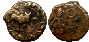
Lot: 38 Ancient, Ujjaini (c. 2nd century BC), Copper Unit, Bull & Mahakal Type, 5.26g, very fine, very scarce. Estimate: ₹3000 - ₹4000