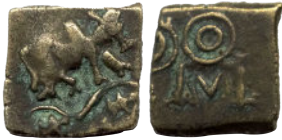
Lot: 65 Ancient, Pre-Satavahana, Sebakas of Vidarbha, (c. 2nd-1st Century BC), Copper Unit, 1.08g, very fine, scarce. Estimate: ₹1000 - ₹1200