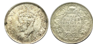
Lot: 812 George VI King, Silver (52%) 1/2 Rupee, 1941, Bombay Mint, About Uncirculated. Estimate: ₹500 - ₹600