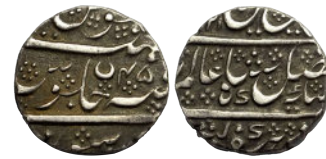
Lot: 592 Mysore State, INO Shah Alam II (AH 1174-1221, 1759-1806 AD), Silver Rupee, Mysore Mint, RY 45, 11.31g, very fine.