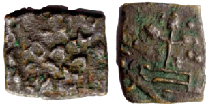
Lot: 101 Ancient, Maharathis from Vidarbha, Maharathi Talathata (c. 150-200 AD), Alloyed Copper Unit, inscribed type, 3.64g very fine, rare. Estimate: ₹5000 - ₹6000