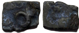
Lot: 83 Ancient, Satavahana, Vidarbha type (1st Century BC), Copper Unit, 0.99g, fine to very fine, scarce.