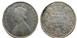
Lot: 721 Victoria Empress, 1897 AD, Silver 1/2 Rupee, Calcutta Mint, Prid # 280, very fine, 5.65g, very scarce. Estimate: ₹3500 - ₹4000