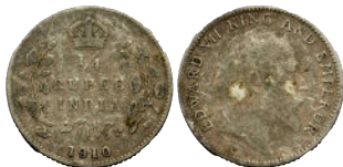
Lot: 759 Edward VII, Silver 1/4 Rupee, 1910, Bombay Mint, Dot on Stem, About Fine. Estimate: ₹1200 - ₹1500