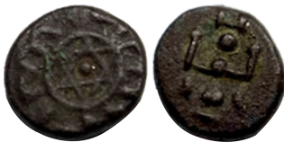
Lot: 611 Travancore, Uthram Thirunal Marthanda Varma, Copper Cash, 0.63g, very fine, very scarce. Estimate: ₹800 - ₹1000