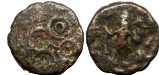
Lot: 46 Ancient, Ujjain (2nd-1st Century BC), Copper Unit, Mahakal Type, 2.88g, very fine, very scarce. Estimate: ₹800 - ₹1000