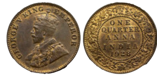
Lot: 804 George V King, Bronze One Quarter Anna, 1928, Bombay Mint, Uncirculated. Estimate: ₹1200 - ₹1500