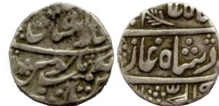
Lot: 590 Mewar State, Shahjahanabad Mint(pseudo), INO Shah Alam II, 10.67g very fine, scarce.