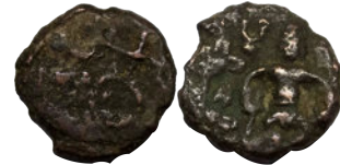
Lot: 36 Ancient, Ujjain (2nd-1st Century BC), Copper Unit, Mahakal Type, 1.59g very fine, very scarce. Estimate: ₹2500 - ₹3000