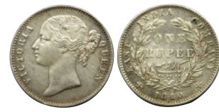
Lot: 680 Victoria Queen, Silver Rupee, 1840, divided legend, Calcutta/Bombay Mint, 28 berries, About Extremely Fine, Scarce. Estimate: ₹1200 - ₹1500