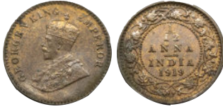
Lot: 805 George V King, Bronze 1/12 Anna, 1919, Calcutta Mint, Uncirculated. Estimate: ₹1200 - ₹1500