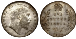
Lot: 753 Edward VII, Silver Rupee, 1910, Bombay Mint, Uncirculated, Beautifully Toned, Very Scarce. Estimate: ₹1200 - ₹1500