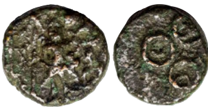
Lot: 39 Ancient, Ujjaini (c. 2nd century BC), Copper Unit, Mahakal Type, 7.03g, very fine, scarce. Estimate: ₹1000 - ₹1200