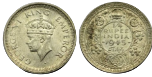
Lot: 823 George VI King, Silver (52%) 1/4 Rupee, 1945, Bombay Mint, About Uncirculated. Estimate: ₹500 - ₹600