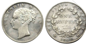
Lot: 679 Victoria Queen, Silver Rupee, 1840, continuous legend, 19 berries, About Extremely Fine, Scarce. Estimate: ₹1200 - ₹1500