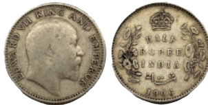
Lot: 757 Edward VII, Silver 1/2 Rupee, 1906, Bombay Mint, Uncirculated, Very Scarce. Estimate: ₹3500 - ₹1500