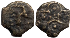
Lot: 25 Ancient, Post-Mauryan, Kaushambi Region, Cast Copper, Bop & Pieper # 8, 0.85g, very fine, scarce. Estimate: ₹1000 - ₹1200