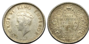
Lot: 811 George VI King, Silver 1/2 Rupee, 1939, Calcutta Mint, About Uncirculated. Estimate: ₹500 - ₹600