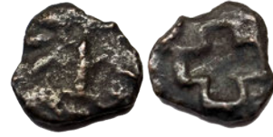
Lot: 24 Ancient, Maurya-Sunga (2nd century BC), Copper Unit, Pieper# p.no 182, Coin no 215, 0.74g, very fine, scarce. Estimate: ₹800 - ₹1000