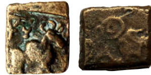
Lot: 28 Ancient, Post-Mauryan, Central India, Narmada Valley, Uninscribed type, Copper Unit, 2.19g very fine, scarce. Estimate: ₹1000 - ₹1200