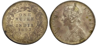
Lot: 717 Victoria Empress, Silver Rupee, 1893, Obv. A/ Rev. I, Bombay Mint "B" Incuse, About Extremely Fine. Estimate: ₹1000 - ₹1200