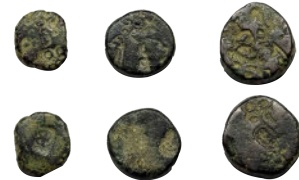
Lot: 16 Ancient, Mauryan, Magadha Imperial (C. 321-150 BC), Copper Punchmark, Set of 3, very fine, scarce. Estimate: ₹2000 - ₹2500