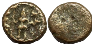
Lot: 47 Ancient, Ujjain (2nd-1st Century BC), Copper Unit, 7.19g very fine, very scarce. Estimate: ₹1500 - ₹2000