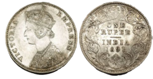
Lot: 714 Victoria Empress, Silver Rupee, 1891, Calcutta Mint, Uncirculated, Scarce. Estimate: ₹1200 - ₹1500