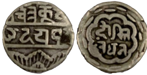
Lot: 589 Mewar state, Swarupshahi series, Dosti Landhan Issue, Silver Rupee, Udaipur Mint, no date, issue of VS 1858-1920 three different designs on obv. 5.26g, (KM Y11). Very Fine.