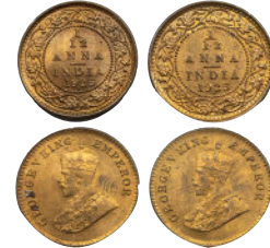
Lot: 808 George V King, Bronze 1/12 Anna, (Set of 2 coins) 1925, Bombay Mint, one Coin with Curved top Stroke of "5", Other coin flat top Stroke of "5", Rare Variation, Uncirculated. Estimate: ₹1200 - ₹1500