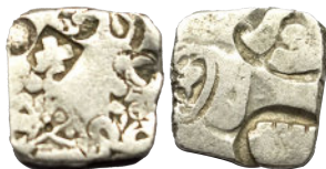
Lot: 17 Ancient, Mauryan, Magadha Imperial (C. 321-150 BC), Silver Karshapana, 2.70g very fine, scarce. Estimate: ₹4200 - ₹4500