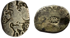
Lot: 13 Ancient, Mauryan, Magadha Imperial (C. 321-150 BC), Silver Karshapana, Punchmark, one punch showcasing a rabbit, 2.89g very fine, scarce. Estimate: ₹1000 - ₹1200