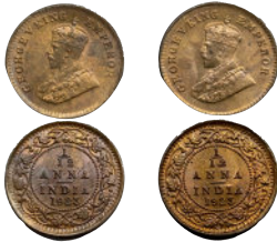
Lot: 807 George V King, Bronze 1/12 Anna, (2 Pcs) 1923, Calcutta Mint, Uncirculated. Estimate: ₹1200 - ₹1500