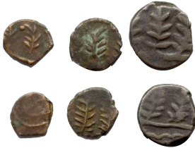
Lot: 591 Mewar State, Set of 3, Copper Paisa, very fine+, scarce.