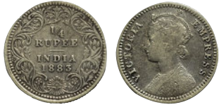
Lot: 725 Victoria Empress, Silver 1/4 Rupee, 1883, Calcutta Mint, Fine, Scarce. Estimate: ₹1200 - ₹1500