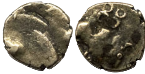
Lot: 43 Ancient, Ujjaini, (2nd-1st Century BC), Copper Fractional Unit, 0.58g, very fine, scarce. Estimate: ₹1500 - ₹2000