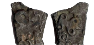
Lot: 84 Ancient, Satavahana, Junnar Area, Fractional Copper Unit, 1.16g very fine, very scarce.