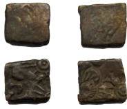
Lot: 11 Ancient, Mauryan, Magadha Imperial (C. 321-150 BC), Copper Karshapana, very fine, scarce. Estimate: ₹800 - ₹1000