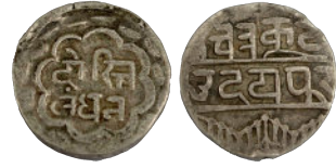
Lot: 588 Mewar state, Swarupshahi series, Dosti Landhan Issue, Silver Rupee, Udaipur Mint, no date, issue of VS 1858-1920 three different designs on obv. 10.86g, (KM Y11). Very Fine.