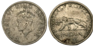
Lot: 825 George VI, Copper Nickel Rupee, 10 'o' Clock, 1947, Very Fine, Very Rare. Estimate: ₹1200 - ₹1500