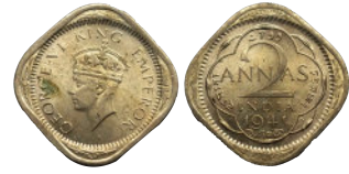
Lot: 828 George VI, Copper-Nickel, 2 Annas, 1941, Calcutta Mint, No dots by year, Head Type II. obv. Desing type I. Estimate: ₹500 - ₹600