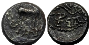
Lot: 105 Ancient, Western Kshatrapas, Rudrasimha I (c. AD 188-197), Potin Drachma, Bull type, obv. a bull standing to right, rev. Brahmi legend around a three-arched hill, 2.10g Very Fine+, Scarce. Estimate: ₹3000 - ₹3500