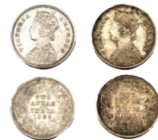
Lot: 732 Victoria Empress, Silver Two Annas (2pcs), 1888, Bombay Mint, 1893, Calcutta Mint, About EXTremely Fine, Very Scarce. Estimate: ₹1500 - ₹2000