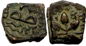
Lot: 99 Ancient, Maharathis from Vidarbha, Maharathi Talathata (c. 150-200 AD), Alloyed Copper Unit, inscribed type 2.16g, very fine, rare. Estimate: ₹1500 - ₹2000