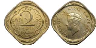
Lot: 826 George VI, Copper-Nickel, 2 Annas, 1939, Bombay Mint, Dots by year, Head Type I. obv. desing type I. Estimate: ₹500 - ₹600