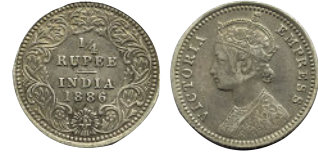
Lot: 726 Victoria Empress, Silver 1/4 Rupee, 1886, Calcutta Mint, Fine, Scarce. Estimate: ₹1200 - ₹1500