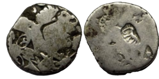
Lot: 12 Ancient, Mauryan, Magadha Imperial (C. 321-150 BC), Silver Karshapana, Punchmark, one punch showcasing elephant, 3.17g very fine, scarce. Estimate: ₹1500 - ₹1800