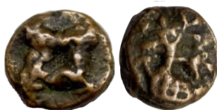
Lot: 19 Ancient, Maurya-Sunga (2nd century BC), Copper Unit, Pieper# p.no 182, Coin no 215, 3.48g very fine, scarce. Estimate: ₹800 - ₹1000