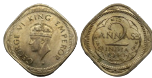
Lot: 829 George VI, Copper-Nickel, 2 Annas, 1946, Bombay Mint, Dots by year, Head Type II, Normal numeral 6, 2nd 'N' in Annas touches the down swing of numeral 2. Obv Desing type III. Estimate: ₹500 - ₹600