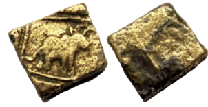
Lot: 62 Ancient, Pre-Satavahana, Vidarbha Region, (c. 2nd-1st Century BC), Copper Unit, 1.38g, very fine, scarce. Estimate: ₹800 - ₹1000