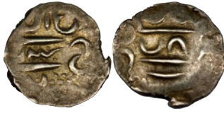
Lot: 587 Ladakh, Mahmud Shah, Silver Ja'u, 2.59g, Tibat-i-Kalan Mint. Very Fine, Rare.