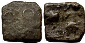
Lot: 45 Ancient, Ujjaini (c. 2nd century BC), Copper Unit, Bull Type, Obv: Bull to right, swastika above, tree in railing, Rev Ujjain Symbol with dots in orbs, Similar to piper 343, 3.84g Fine. Estimate: ₹1500 - ₹2000