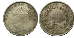
Lot: 678 Victoria Queen, Silver Rupee, 1840, continuous legend, Calcutta/Bombay Mint, 35 berries, About Extremely Fine, Scarce. Estimate: ₹1200 - ₹1500