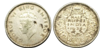
Lot: 810 George VI King, Silver 1/2 Rupee, 1938, Bombay Mint, About Extremely Fine. Estimate: ₹500 - ₹600