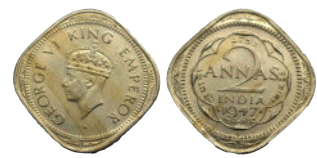
Lot: 830 George VI, Copper-Nickel, 2 Annas, 1947, Bombay Mint, Dots by year, Head Type II. Obv. desing type III, Mint State. Rare. Estimate: ₹500 - ₹600