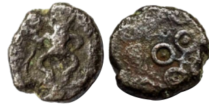
Lot: 48 Ancient, Ujjain (2nd-1st Century BC), Copper Unit, 1.55g about very fine, very scarce. Estimate: ₹1500 - ₹2000