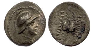
Lot: 81 Indo-Greek, Bactria, Eukratides I, (c. 171-145 BC), Silver Obol, Boparachchi & Rahman Series 9 #60c, 0.55g, very fine, rare.