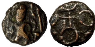
Lot: 35 Ancient, Ujjain (2nd-1st Century BC), Copper Unit, Mahakal Type, 2.10g very fine, very scarce. Estimate: ₹800 - ₹1000