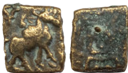
Lot: 67 Ancient, Pre-Satavahana, Sebakas of Vidarbha, (c. 2nd-1st Century BC), Copper Unit, 1.80g very fine, scarce. Estimate: ₹800 - ₹1000