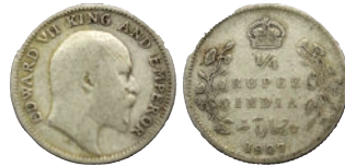
Lot: 758 Edward VII, Silver 1/4 Rupee, 1907, About Fine. Estimate: ₹1200 - ₹1500