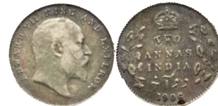
Lot: 760 Edward VII, Silver Two Annas, 1906, About Fine. Estimate: ₹1200 - ₹1500