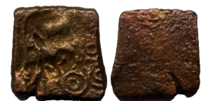
Lot: 20 Ancient, Punch Marked Coinage, Eran region (2nd-1st Century BC), Copper Unit, 4.10g fine to very fine, very scarce. Estimate: ₹1000 - ₹1200