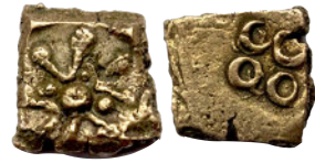
Lot: 32 Ancient, Pre Satavahana, Central India, Mahasenapati, Copper Fractional Unit, very fine, 1.11g, very scarce. Estimate: ₹800 - ₹1000