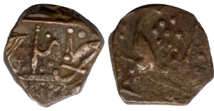
Lot: 607 Sant Rampur State, (1870-1920 AD), Copper Paisa, 8.51g fine, scarce. Estimate: ₹2000 - ₹2200