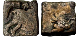
Lot: 64 Ancient, Pre Satavahana, Bhadra & Mitra Series (2nd Century BC), Vidarbha, Copper Unit, 3.33g fine, rare. Estimate: ₹3000 - ₹4000