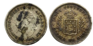
Lot: 616 1881, India Portugueza OITAVO DE Rupia, Silver, About Extremely Fine. Estimate: ₹1500 - ₹1800