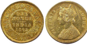
Lot: 677 Victoria Queen, Gold Mohur, 1862, single flower in bottom panel of jabot, without V in Jabot (Prid 1), Very Fine+, Rare. Estimate: ₹175000 - ₹200000