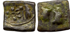
Lot: 34 Ancient, Saurashtra Janapada, (75-50 BC), Uninscribed die-struck, Copper Unit, Piper # 510, 5.69g very fine, scarce. Estimate: ₹800 - ₹1000