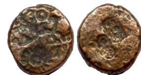
Lot: 18 Ancient, Mauryan, Magadha Imperial (C. 321-150 BC), Copper Karshapana, 4.77g very fine, scarce. Estimate: ₹800 - ₹1000