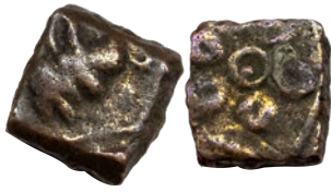
Lot: 31 Ancient India, Central India, Pre Satavahana, Copper Unit, 1.21g very fine, scarce. Estimate: ₹800 - ₹1000