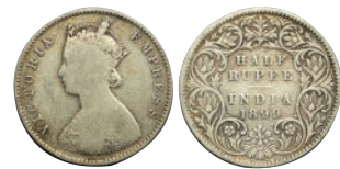
Lot: 722 Victoria Empress, Silver 1/2, 1899, Calcutta Mint, About fine. Estimate: ₹1000 - ₹1200