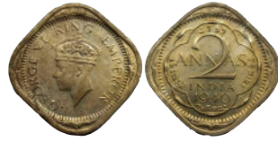
Lot: 827 George VI, Copper-Nickel, 2 Annas, 1940, Calcutta Mint, No dots by year, Head Type I. Obv. Desing type I. Estimate: ₹500 - ₹600