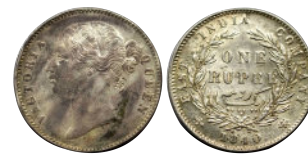
Lot: 682 Victoria Queen, Silver Rupee, 1840, divided legend, Calcutta/Bombay Mint, 28 berries, About uncirculated, Scarce. Estimate: ₹1200 - ₹1500