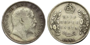
Lot: 755 Edward VII, Silver 1/2, 1905, About Fine. Estimate: ₹1200 - ₹1500