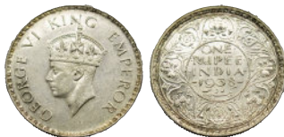
Lot: 809 George VI King, Silver Rupee, 1938, Bombay Mint, Without Mint Mark, About Uncirculated. Estimate: ₹500 - ₹600