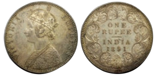
Lot: 715 Victoria Empress, Silver Rupee, 1891, Obv. A/ Rev. I, Bombay Mint "B" Incuse, About Extremely Fine. Estimate: ₹1000 - ₹1200