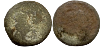
Lot: 98 Ancient, Ancient, Satvahana, Paithan Satakarni, Lead Unit, 13g fine. Estimate: ₹2500 - ₹3000