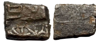
Lot: 80 Ancient, Erikacha Monarchical, Sahasasena (c. 1st Century BC), Copper Unit, 1.87g very fine, very scarce.