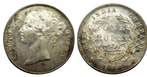
Lot: 681 Victoria Queen, Silver Rupee, 1840, divided legend, Calcutta/Bombay Mint, 28 berries, About uncirculated, Scarce. Estimate: ₹1200 - ₹1500