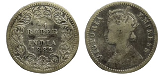
Lot: 724 Victoria Empress, Silver 1/4 Rupee, 1882, Calcutta Mint, Fine, Scarce. Estimate: ₹1200 - ₹1500