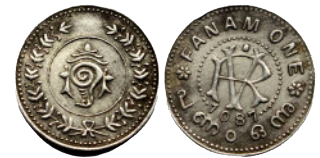
Lot: 610 Travancore State, Rama Varma VI, Silver Fanam, ME 1087, KM # 65, 1.53g very fine, scarce. Estimate: ₹1500 - ₹1800