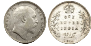
Lot: 754 Edward VII, Silver Rupee, 1910, Bombay Mint, 10 over 9, About Extremely Fine, Very Scarce. Estimate: ₹2000 - ₹2500