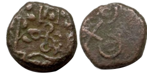
Lot: 42 Ancient, Ujjain, (2nd-1st Century BC), Copper Unit, similar Pieper # 763, pg. 111, 2.46g very fine, very scarce. Estimate: ₹800 - ₹1000