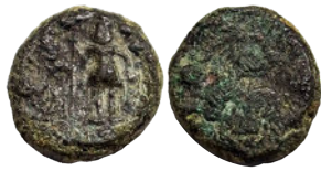
Lot: 41 Ancient, Ujjaini (c. 2nd century BC), Copper Unit, Mahakal, Type, 7.85g, very fine, scarce. Estimate: ₹1500 - ₹2000