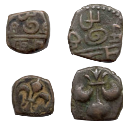
Lot: 614 Indo-French, (AD 1720-1835), Copper Doudou, Pondichery Mint, Obv: Fleur-de-lis, Rev: Tamil inscription Pudu/tche/ri, very fine, scarce. Estimate: ₹1500 - ₹1800