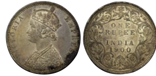
Lot: 718 Victoria Empress, Silver Rupee, 1900, Obv. A/ Rev. I, Bombay Mint "B" Incuse, About Extremely Fine. Estimate: ₹1000 - ₹1200