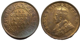
Lot: 803 George V King, Bronze One Quarter Anna, 1919, Calcutta Mint, Uncirculated. Estimate: ₹1200 - ₹1500